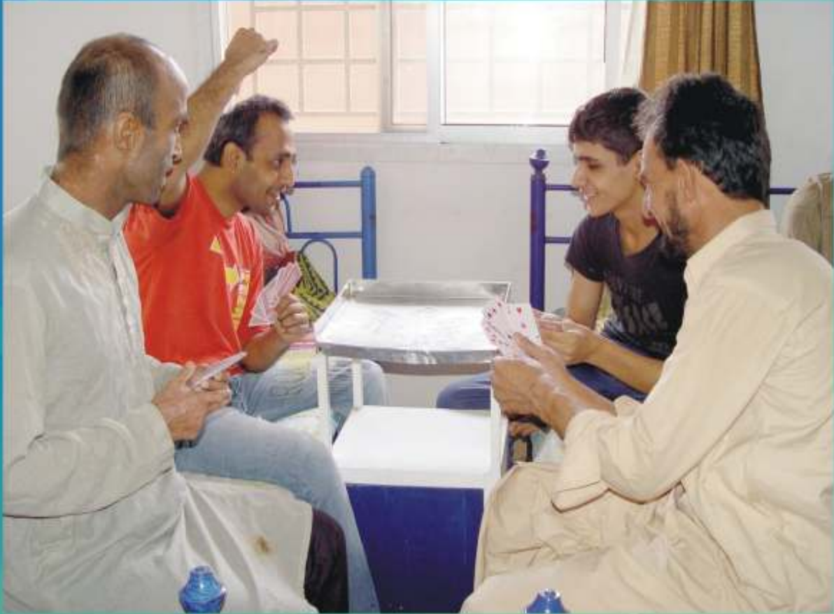
Patients are playing cards.