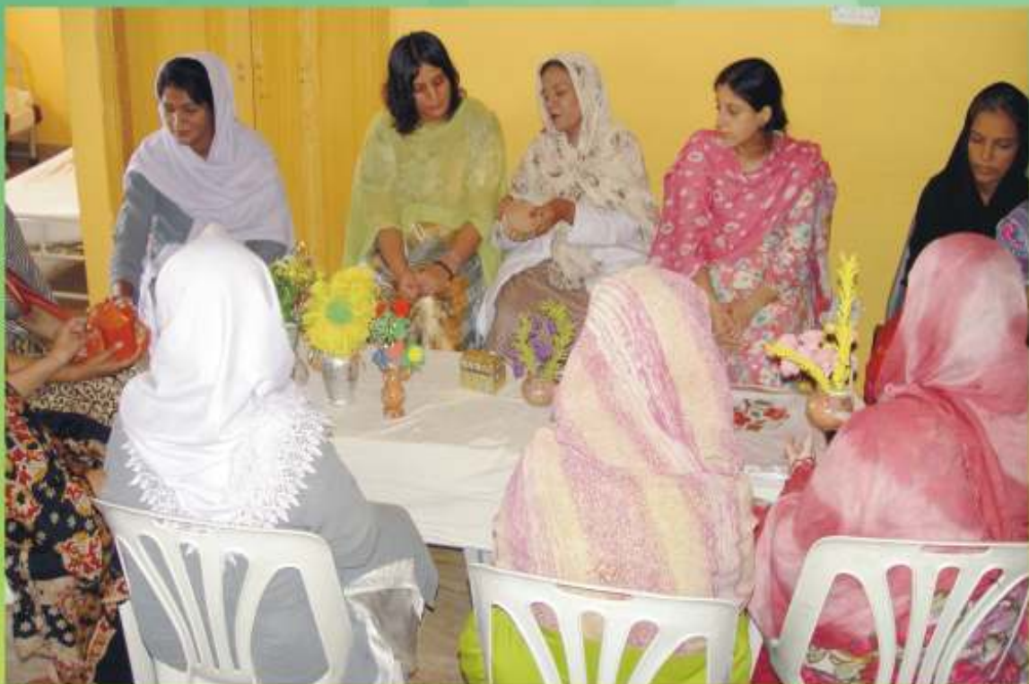
Female Ward Unit incharge is checking patient's handcraft work.