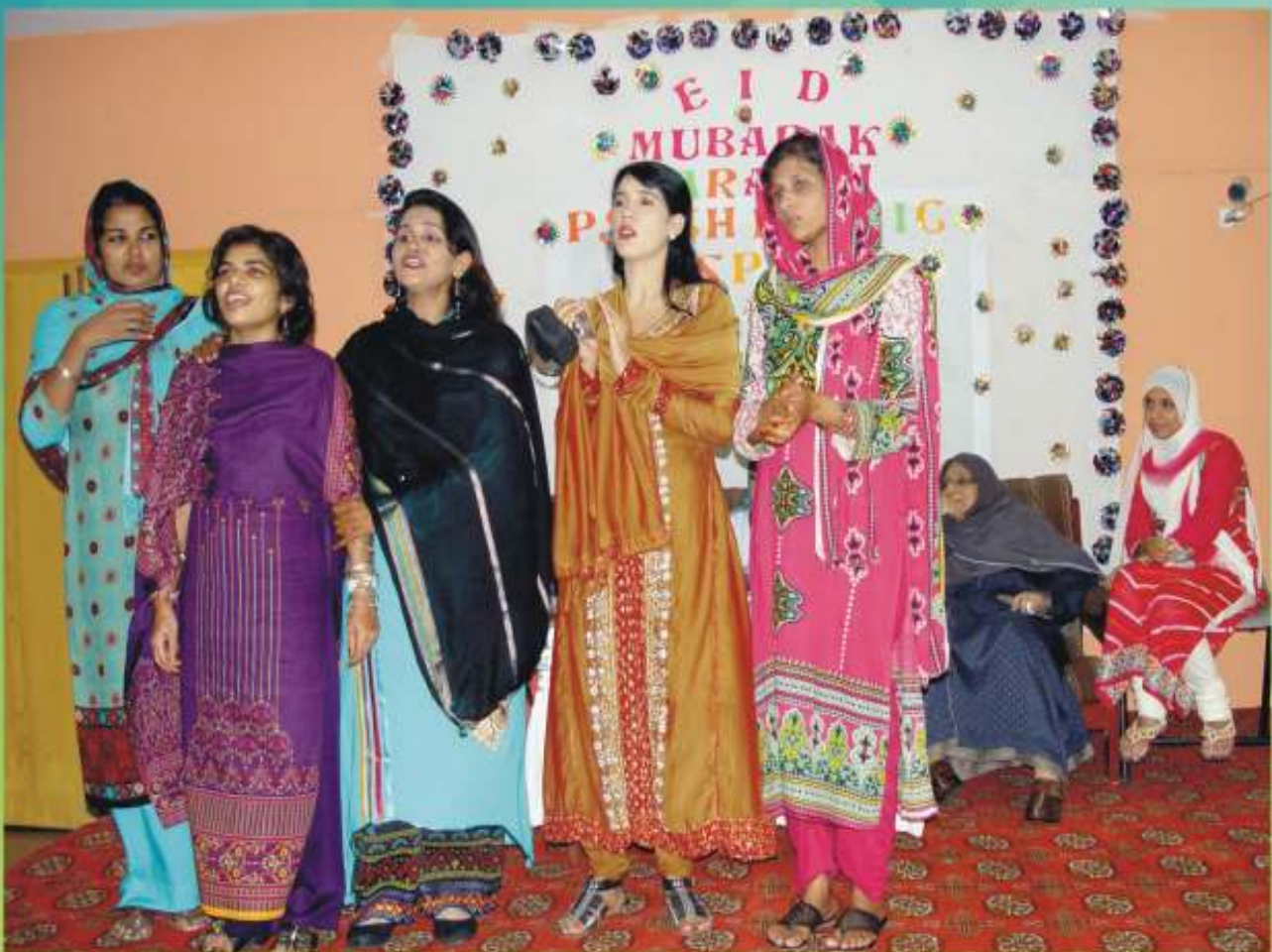
KPH Staff singing songs with patients on EID Celebration